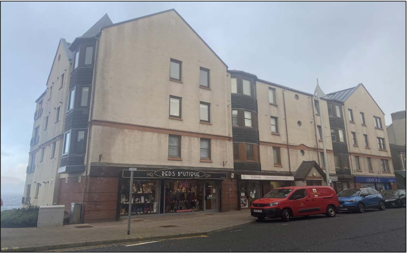
View of 24 Admirals Court, 84 Kempock Street from the front

The qualities of being 'Connected', 'Sustainable' and 'Adaptable' in Policy 14 of NPF4 are relevant to this application. The relevant qualities in Policy 1 of the LDPs are being 'Resource Efficient', through making use of existing buildings and previously developed land; 'Easy to Move Around', by being well connected and recognising the needs of pedestrians and cyclists; and 'Safe and Pleasant' which can be achieved through avoiding conflict with adjacent uses and minimising the impact on traffic and parking on the street scene.